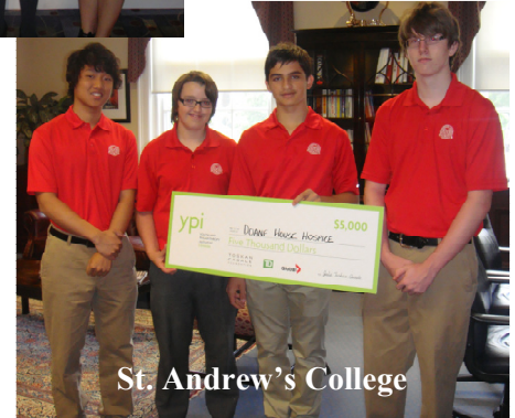
St. Andrew's College